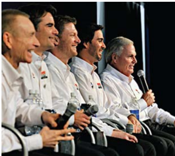
(l-r) Team Hendrick: Mark Martin, Jeff Gordon, Dale Earnhardt Jr. and Jimmie Johnson with owner, Rick Hendrick.

Atlanta's diverse and growing population, combined with a strong corporate and philanthropic presence, creates an ideal environment for engaging people in our life-saving mission. Launched in January 2009, Be The Match Atlanta will recruit and engage residents in the metropolitan Atlanta area. Home to more than 5.38 million people, and the largest consortium of historically black colleges and universities in the country, Atlanta is a key market for increasing and diversifying the marrow registry. Atlanta also has the nation's third largest concentration of Fortune 500 companies, major league sports franchises, and three of NMDP's network collaborating transplant centers: Aflac Children's Cancer Center, Northside Hospital, and Winship Cancer Institute at Emory University.