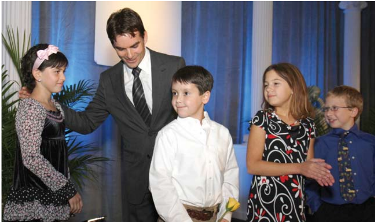
Jeff Gordon shares the stage with some very special guests at “A Hero’s Journey” fundraiser for pediatric patients.

— Jeff Gordon, Four-time NASCAR Cup Series champion